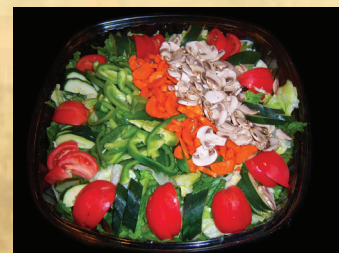
Our Famous Salad Bowl